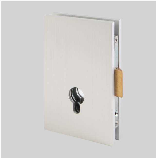
Case lock without stop

511.00.100 prepared for round cylinder without stop